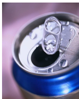
A Can of Soda