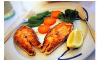
A healthy meal for a family of three