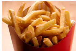
A Small Fires