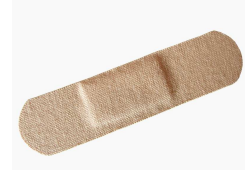
A comfort kit for a family affected by disaster